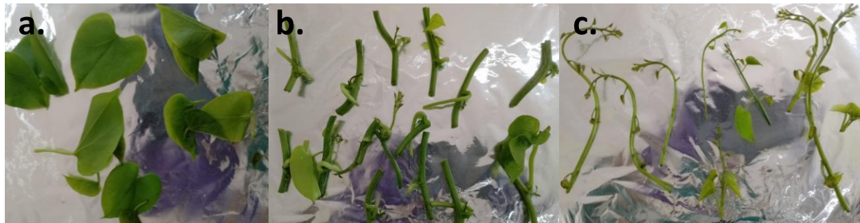
Fig 2: Different explants of Tinospora cordifolia (Willd) Miersa. Young leaves b. Nodes c. Shoot

For the current study, mature and healthy plants of Tinospora cordifolia were collected from Doddanekkundi, Bengaluru. Shoot meristems, nodes and young leaves were taken as explants for the in vitro cultivation of plant.