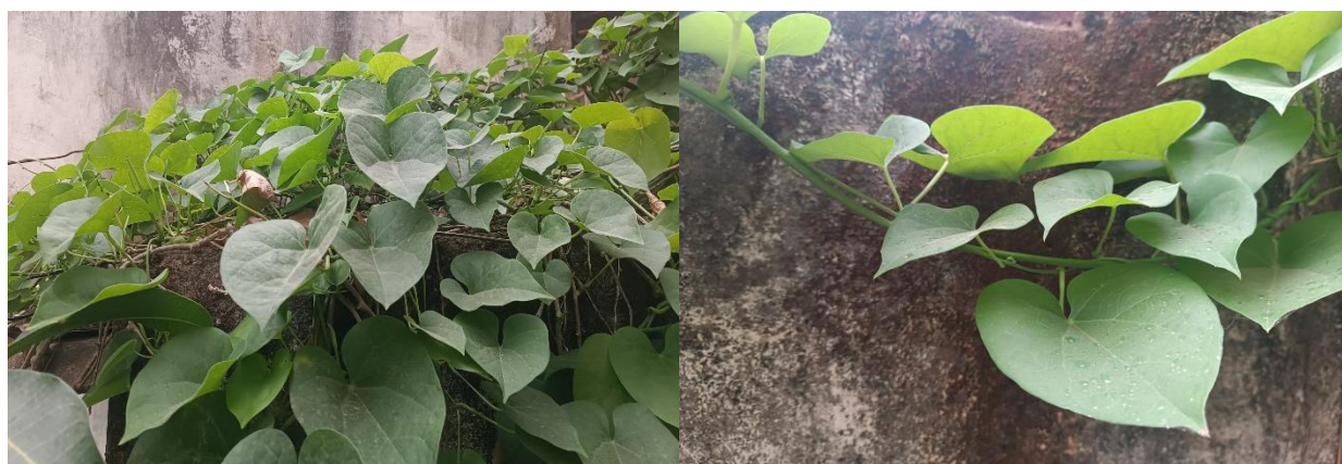
Fig 1: Tinospora cordifolia