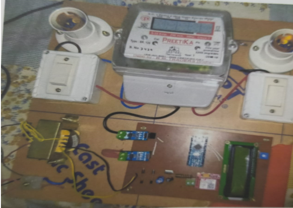
Figure Status When It Is Off