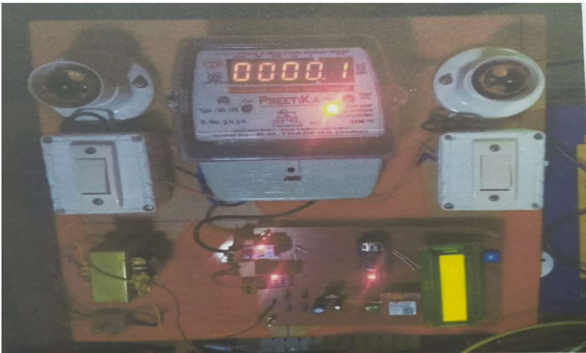
Figure Status When It Is On